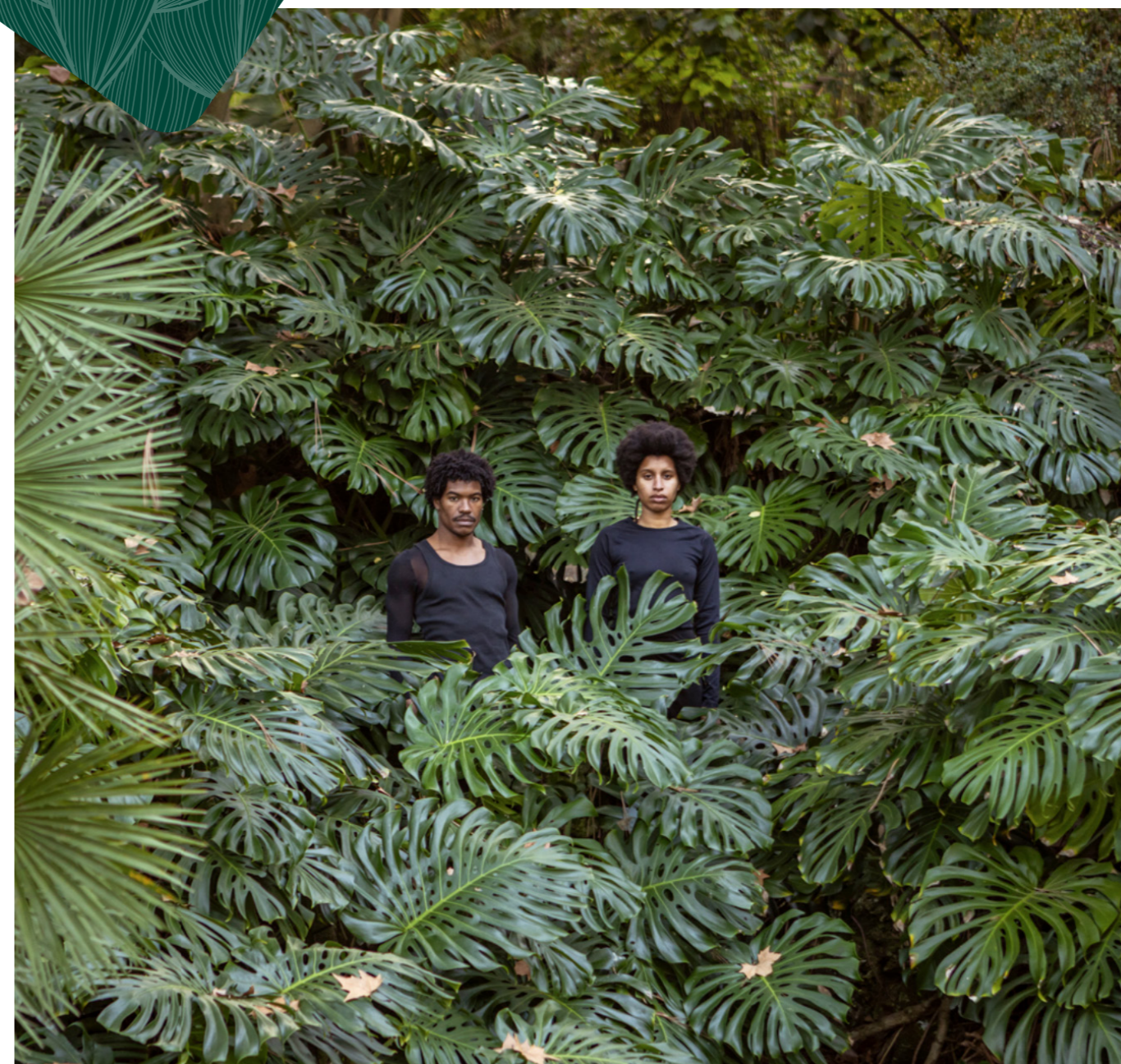
Mónica de Miranda, Creole Garden, 2024.